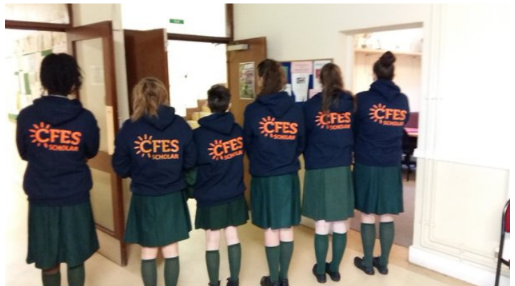
3RD Year Students proudly wearing their brand new CFES Hoodies.

3rd year College For Every Student scholars have been very busy this term preparing for their mock exams and thinking about Transition Year. Lots of meetings with mentors have taken place and mentors have given great study advice and support to nervous scholars! Our CFES hoodies have arrived and are available to 3rd years at a reduced cost of €10. Look out for our new CFES noticeboard which will display mentor information and times of upcoming meetings