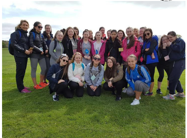
Members of the Orienteering Team in Malahide Castle.

The girls ran the course, maps in hand and then enjoyed a well deserved lunch break in the sun. Well done to everyone who proudly participated.