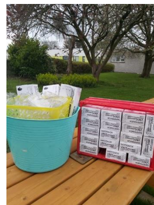
Loreto PPE donation